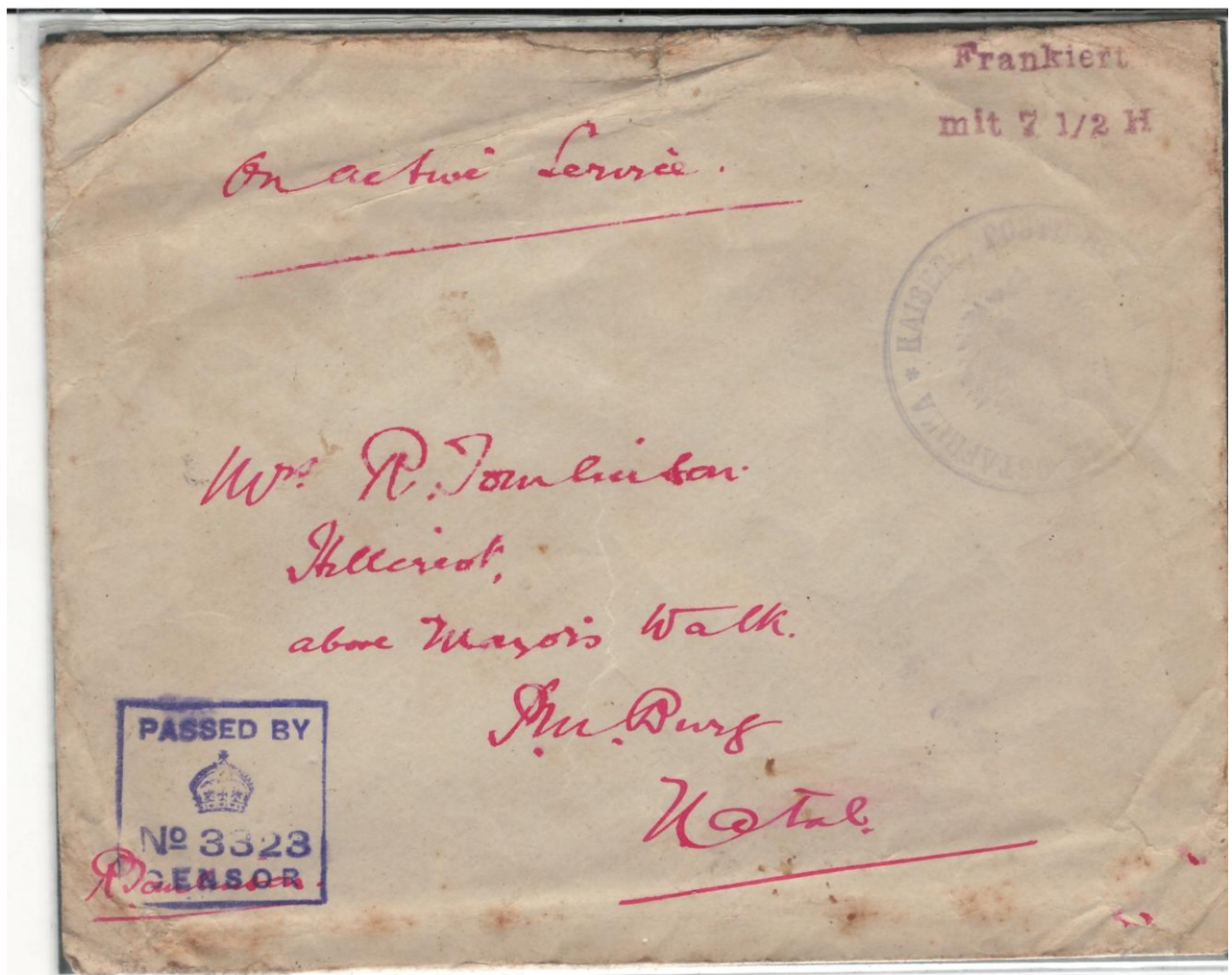
Envelope addressed to Pietermaritzburg

An example of a letter posted from Tanganyika is shown below.