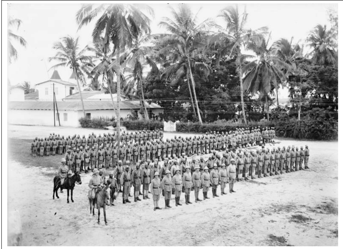
German Askaris on parade in Tanga

In the East Africa Campaign 1914-18, German forces led by Paul von Lettow-Vorbeck fought British and Allied forces in Tanganyika and Mozambique.