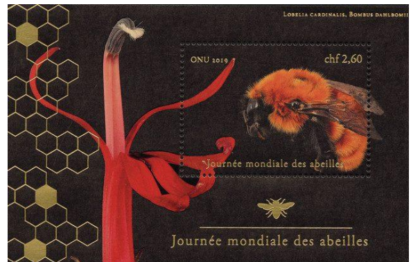
United Nations, New York World Bee Day miniature sheet

Key worldwide events occurring this month include Labour Day on 01 May (which is also a public holiday) and Africa Day on 25 May. There are also numerous other "theme days" including World Bee Day which is celebrated on the 20 th of May.