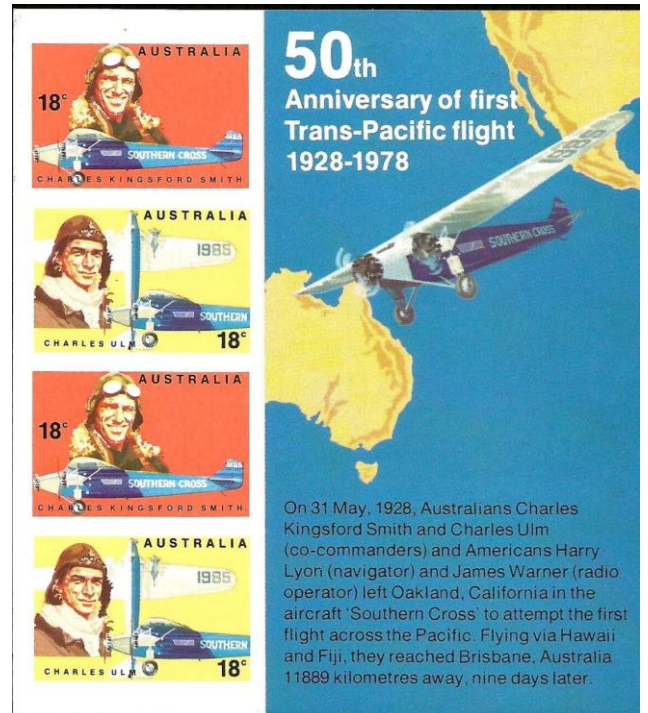
1978 imperforate mini sheet with Kingsford-Smith, Ulm, World Map and the Southern Cross

The image shows all four of the stamps that were issued Kingsford-Smith was knighted for his achievements and the "Southern Cross" is on permanent display at Brisbane Airport. The main airport at Sydney is named after him as well as a street and a school in Brisbane. In 1978 the Australian Post Office issued a set of four stamps commemorating early Australian aviators which included Sir Charles Kingsford-Smith, Charles Ulm and the "Southern Cross"