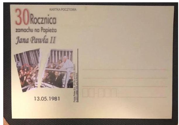
Postcard commemorating the 30 th Anniversary of the attempted assassination

On May 13, 1981 - Pope John Paul II was shot twice at close range while riding in an open automobile in St. Peter's Square in Rome. Two other persons were also wounded. An escaped terrorist, already under sentence of death for the murder of a Turkish journalist, was immediately arrested and was later convicted of attempted murder. The Pope recovered and later held a private meeting with the would-be assassin and then publicly forgave him.