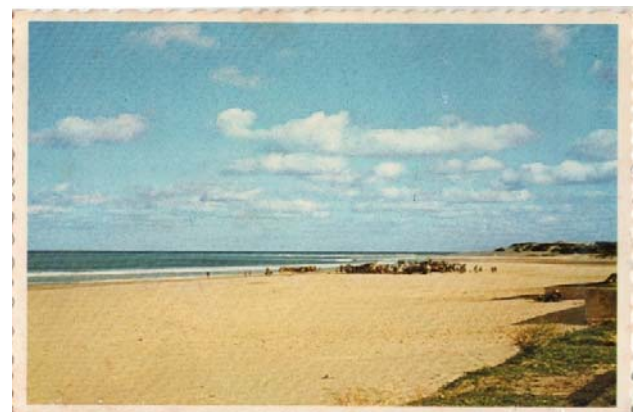
Jeffreys Bay Beach.

Christian Trump treated the society to a two-frame exhibit of the flower definitive issue of Germany (see next page). This definitive issue was in use from 2005 until 2019 and all values were issued in sheets of ten. In 2017 a new ENA (European Article Number) code was introduced and printed on the left and right side of the sheets. An interesting addition to the definitive issue was a rose stamp that, when rubbed, gave off a rose smell. A truly beautiful definitive issue and it is quite clear why it made such an impression on Christian.