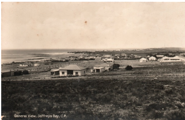
General view of Jeffreys Bay.