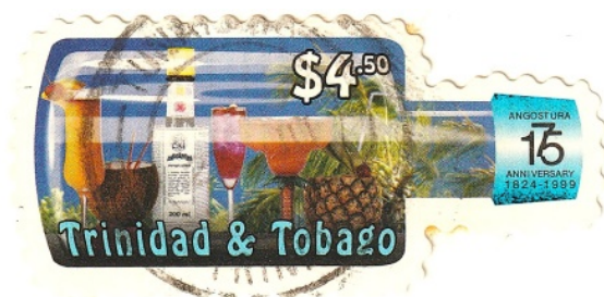
Trinidad and Tobago stamp for Angostura Bitters.