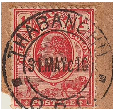
Orange River Colony stamp used on the date that the Union of South Africa came into being.