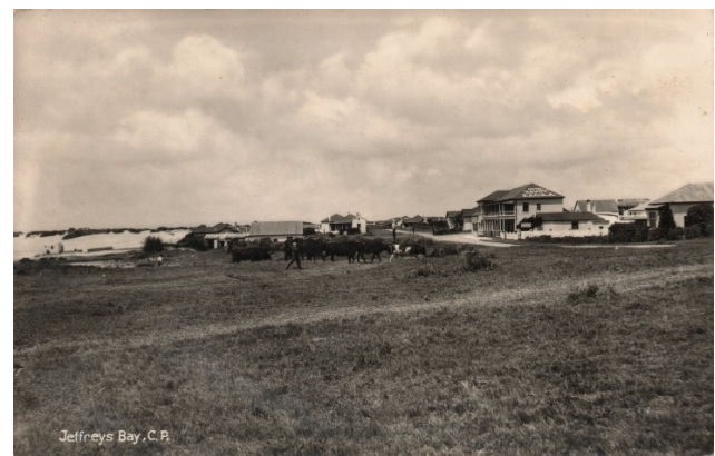
Cattle grazing in front of Savoy Hotel.