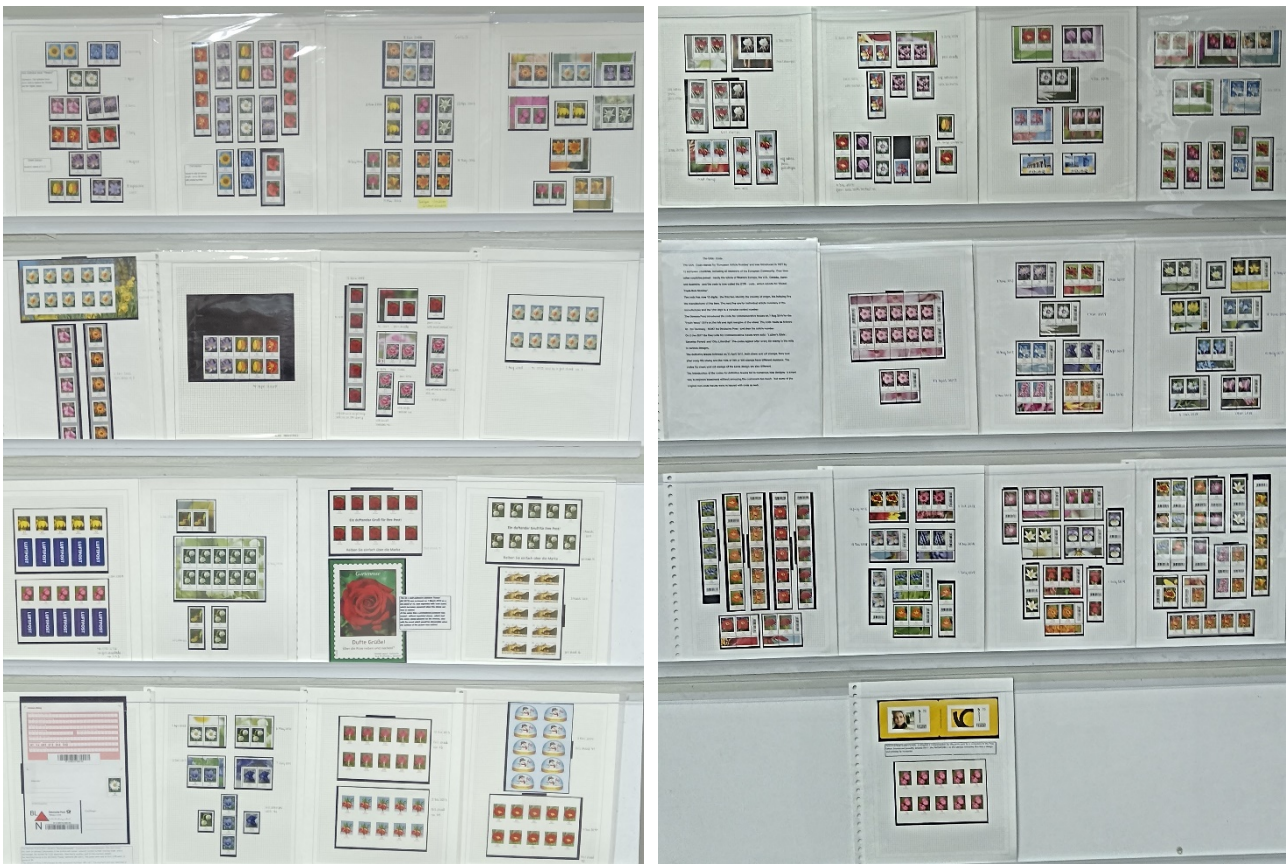
Exhibit showing beautiful German flowers definitive issue from 2005 - 2019.