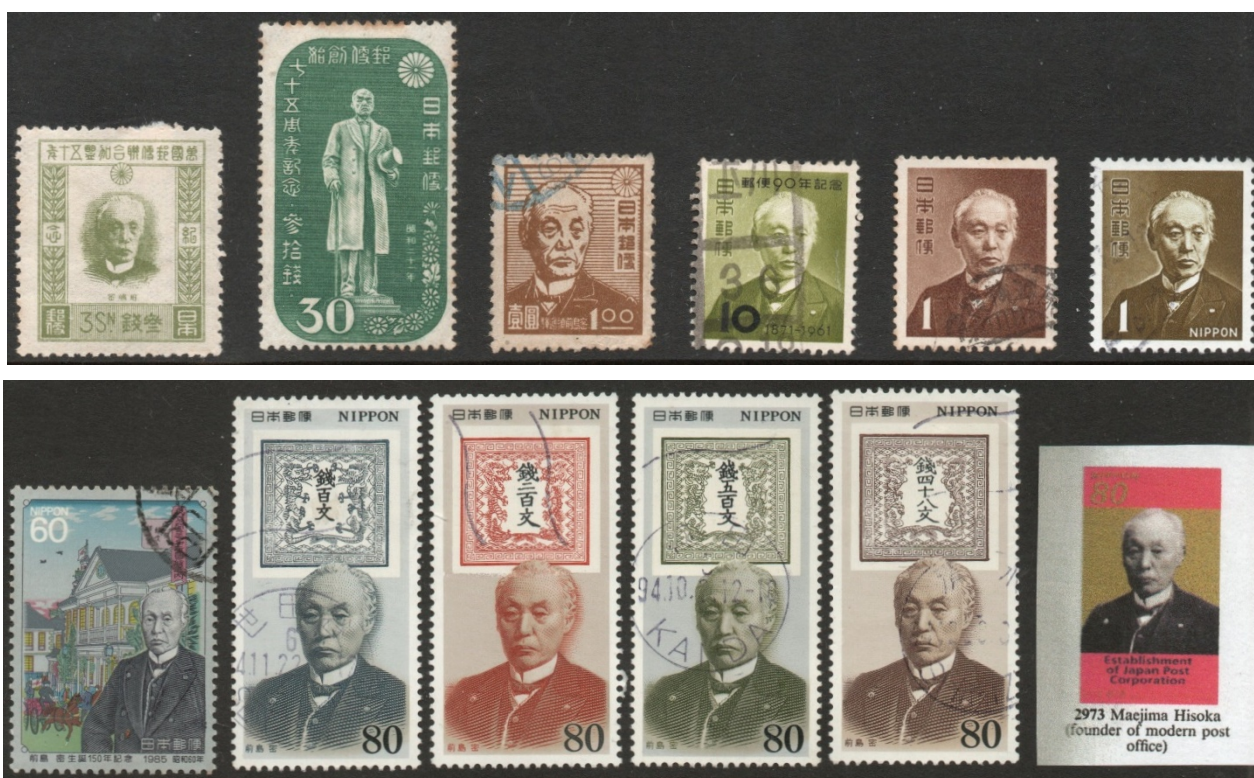
Baron Maejima Hisoko on Japanese stamp issues.

By the time Maejima retired in 1881, the Japanese postal system had expanded to 5 099 post offices and was continuing to grow. Ennobled with the title of danshaku (baron) under the kazoku peerage system in 1902, he served as a member of the House of Peers from 1904 - 1910. He has been honoured on several Japanese postage stamps, as shown below.