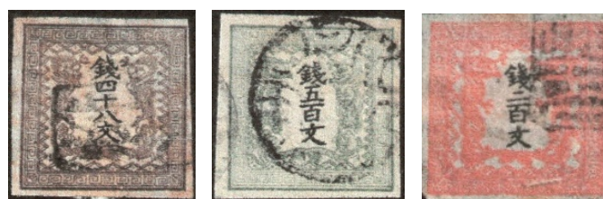
Three of Japan's first stamp issues.

The early postal system in Japan was characterised by a feudal network of post stations along the main highways, known as Go-kaido, which extended from Edo to various cities. Mail was delivered on foot by couriers called hikyaku, often over treacherous mountain trails. The system evolved to include money remittance services for merchants and traders, forming the foundation for Japan Post's banking functions. The Meiji era saw the establishment of Japan's first modern postal service in 1871, which was modeled after the British postal system, including the Penny Post reforms. This system aimed to make mail accessible and affordable to all citizens, promoting democratic ideals and modernisation. Illustrated below are three of Japan's first stamp issues.