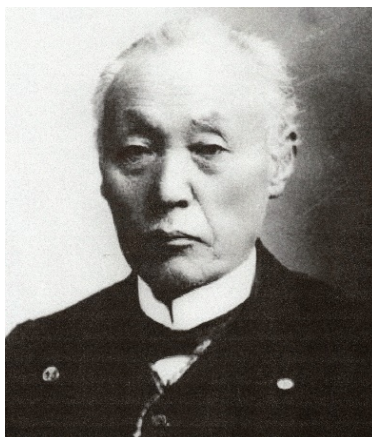
Baron Maejima Hisoko.