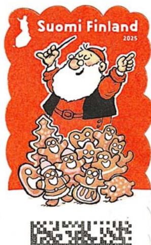
Christmas stamp from Finland.