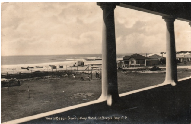
View of beach from Savoy Hotel.