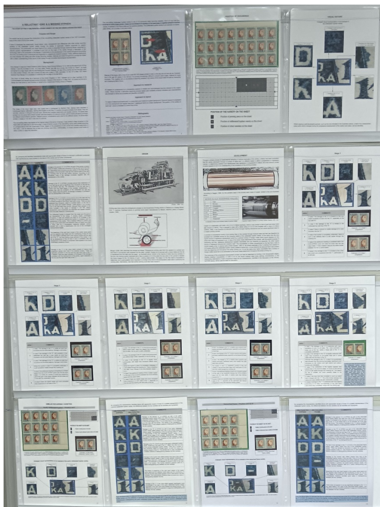
Exhibit of the 1937 coronation of King George VI issue's 1s hyphen flaw.