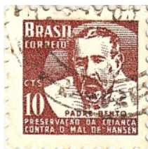
Small Brazilian postal tax stamp.