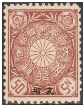
The chrysanthemum on a Japanese stamp.

The chrysanthemum emblem was a significant feature on Japanese stamps from 1899 until 1947. The emblem was a stylised circle with 16 petals radiating out from a smaller circle in the center and it was inscribed only in Japanese. The chrysanthemum emblem was also present on the imperial chrysanthemum crest, which was used on stamps issued before 1947. This emblem was a key identifier for collectors and was used to denote the country's identity on stamps, see below.