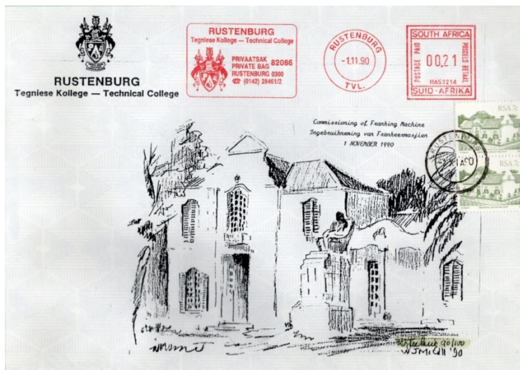
Cover celebrating the Rustenburg Technical College's new franking machine.