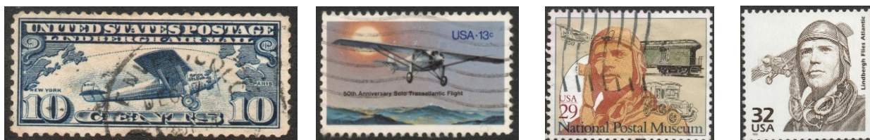
USA stamps Nos SG A646, SG 1686, SG 2841 and SG 3433.