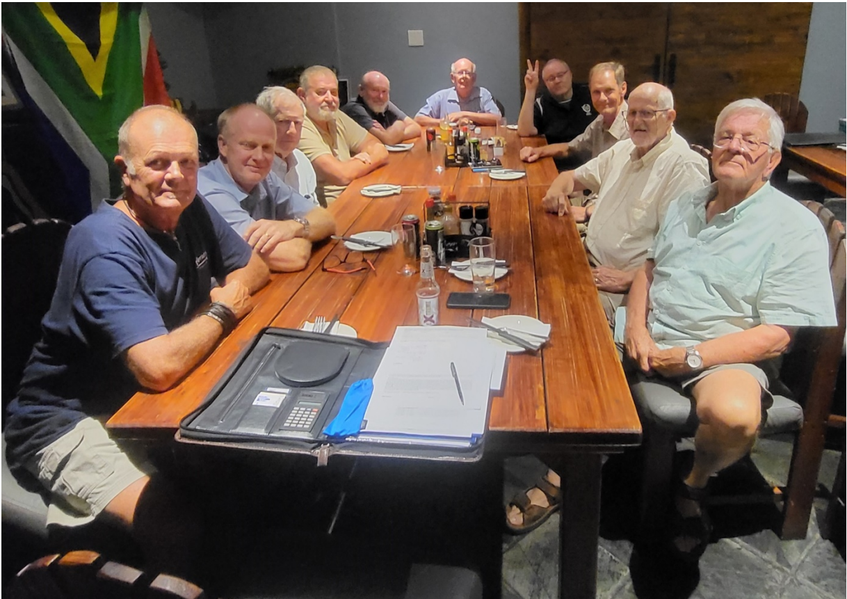
Team A that came a creditable (or not) second.