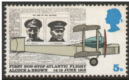
Great Britain Alcock and Brown stamp from 1969.