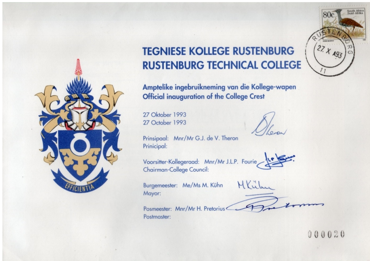
New crest cover from Rustenburg Technical College.