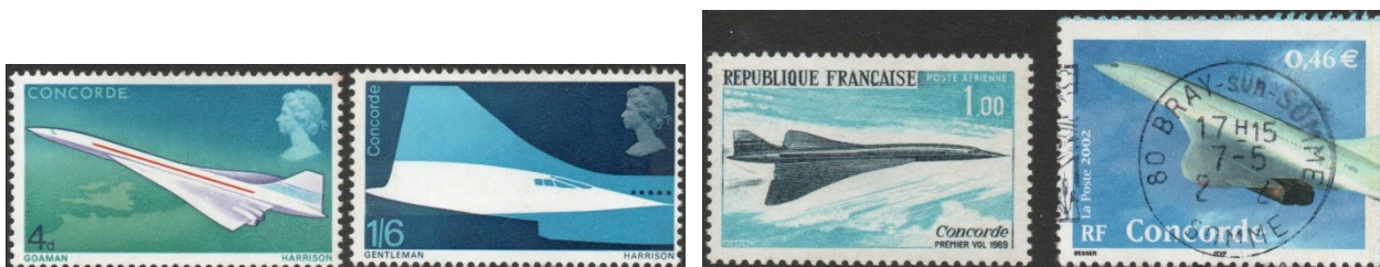
The Concorde on stamps from Great Britain (1969) and France (2002).

Finally, Ian said that the fastest crossing by a commercial airliner probably was by the Anglo-French Concorde. While subsonic commercial jets took eight hours to fly from Paris to New York (seven hours from New York to Paris), the average supersonic flight time on the transatlantic routes was just under 3½ hours. The Concorde had a maximum cruising altitude of 18 300 meters (60 000ft) and an average cruise speed of Mach 2,02 (2 150 km/h; 1 330 mph), more than twice the speed of conventional aircraft. Two issues of Concorde stamps by Great Britain (1969) and France (2002) are shown below.