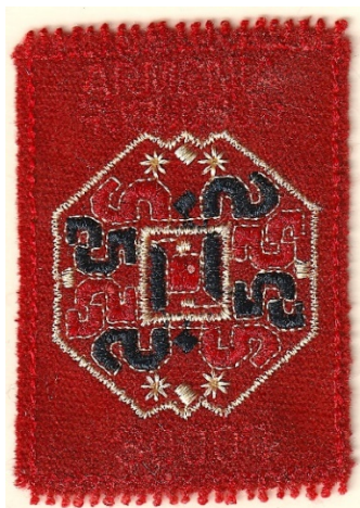
Armenian embroidered stamp.

Next Dave showed the first embroidered Armenian postage stamp that depicts a part of the pattern used in "Khndzoresk" carpets, see below. The stamp has a unique format as it is fully embroidered and has a self-adhesive backing. The embroidery edge mimics postage stamp perforation. The type of "Khndzoresk" carpet belongs to a separate subgroup of dragon carpets. This carpet is characterised by an ornament symbolising eternity (ornament is a term used to describe a decorative object with a specific cultural or symbolic significance like a swastika, star, etc) and eight stylised images of a dragon framing it. This type of a carpet is typical for the carpet-making centers of Artsakh and Syunik.