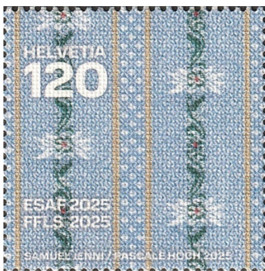
Swiss stamp with "textile" feel from 2025.