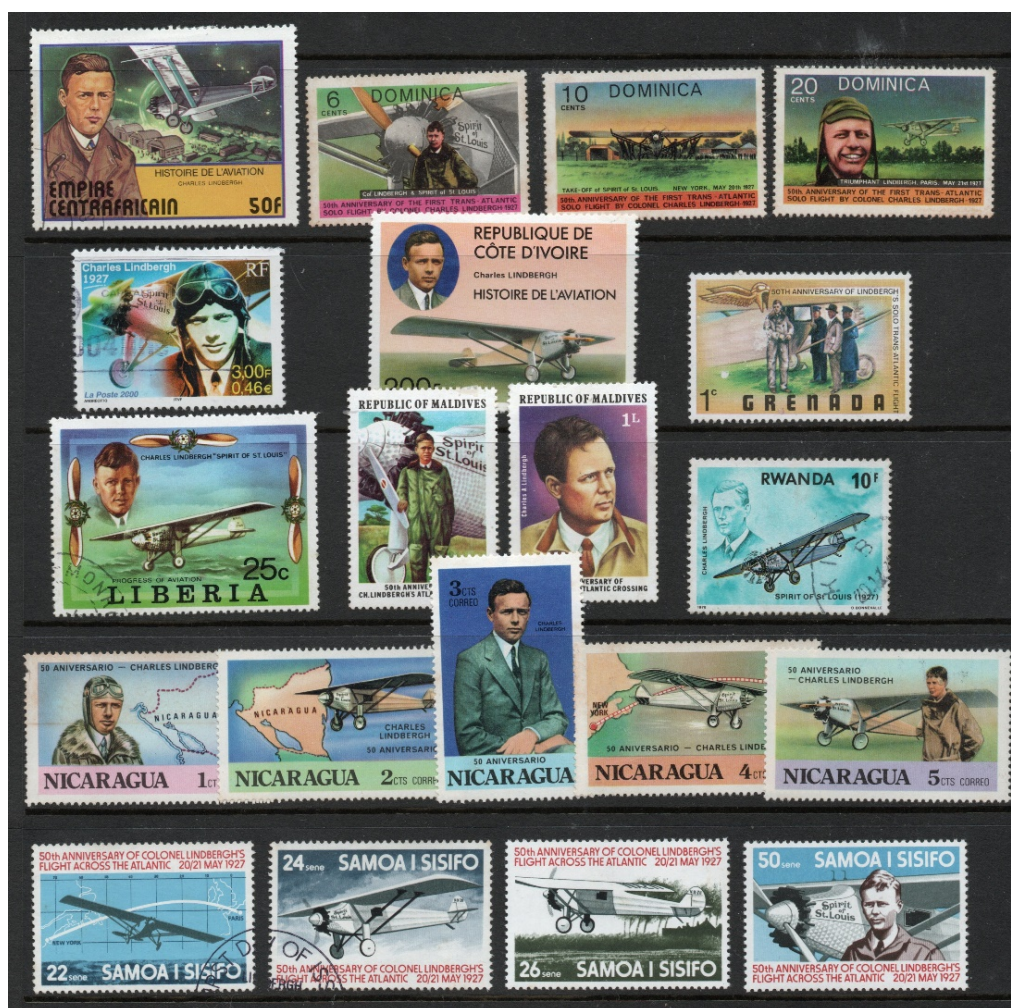
Charles Lindbergh on stamps from other countries.