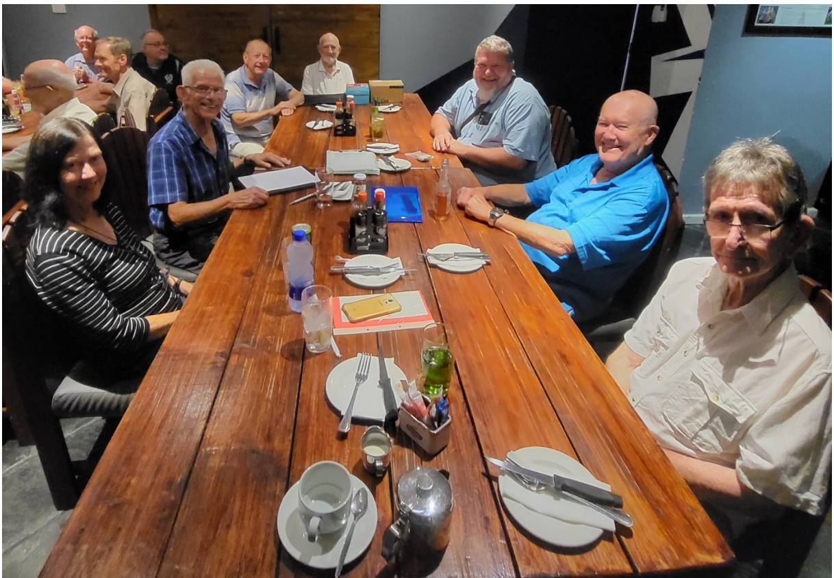
Team B - the winning team that walked away with the prizes.

The meeting closed 13:15 with there being no further matters to discuss.