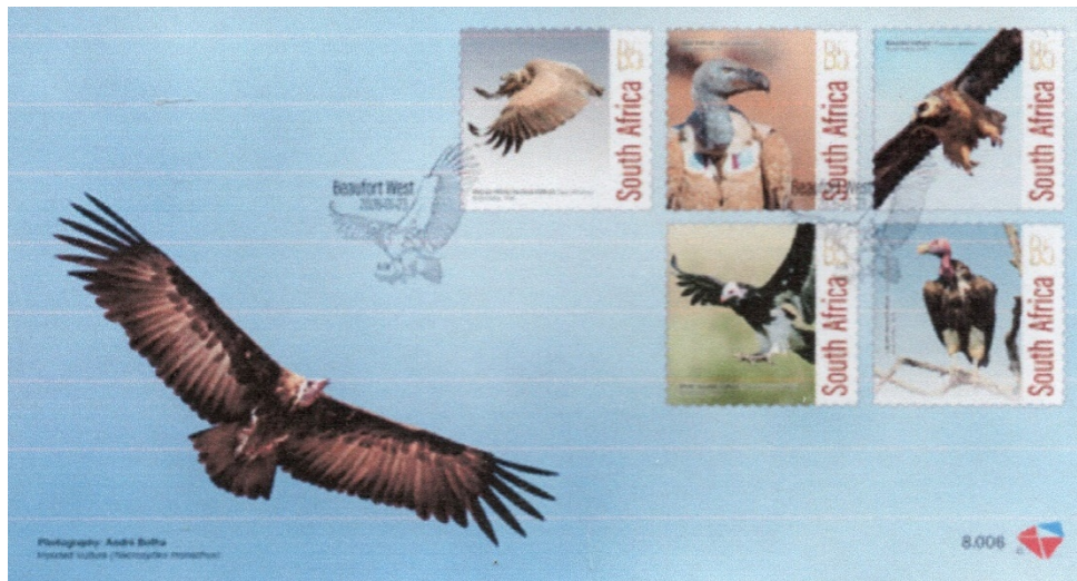
Critically endangered vultures first day cover.