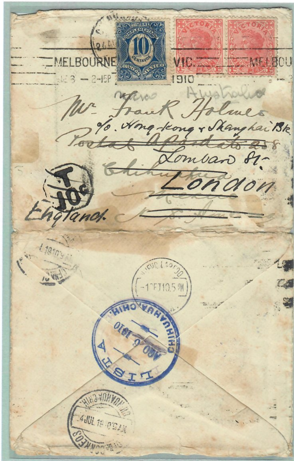
Letter from Melbourne, Australia to Chihuahua, México, 1910 fined in Melbourne. The letter arrives to México and paid the 10c missing rate with "Complementary stamp"; due to the destinatary was not in the country letter was addressed to London to end the postal process and be delivered.