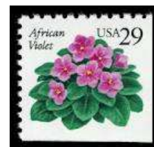
A most beautiful African Violet

Incidentally, roses are not the flowers for Valentine’s Day but primroses and violets are. As we are in Africa why not give your loved one an African violet? A nice house gift!