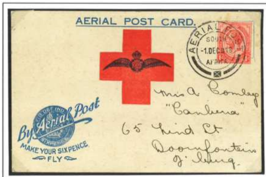
Benoni flight on the 30th November 1918. Lieutenant Gearing flew from Turffontein to Benoni, passing over Germiston and Boksburg. They were unable to land in Benoni because of the crowds gathered on the landing strip. The flight was repeated the next day and Lieutenant Gearing landed on the Benoni Racecourse, where the mail was delivered and taken back to Johannesburg. The postcard displays a franked KGV 1d stamp dated 1.DEC.B18. Known as the 'Small Wings' cards.