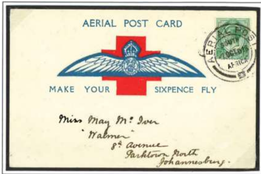
First flight on the 7th October 1918. Posted to Johannesburg with a franked KGV ½d stamp dated 7.OCT.D18. On the reverse side the inscription reads "This card is going to be carried in the air first and then sent to you". Known as the 'Large Wings' cards.