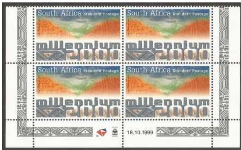
Above: RSA 2000 Millenium corner block issued 01 January 2000