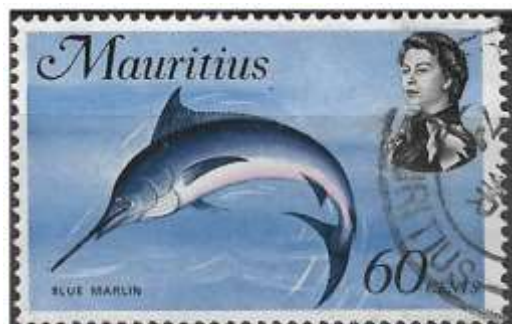
Below: Mauritius Blue Marlin stamp issued in 1969

Julia Evans is looking for this stamp on the left and needs your help!