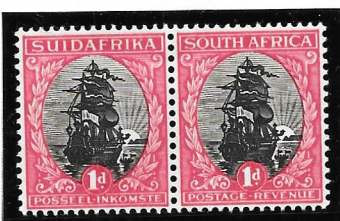
Complete trial Gummed paper No watermark