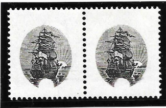
Interior Cylinder Perforate Gummed paper No watermark