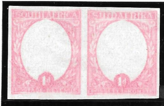
Exterior Cylinder Imperforate Un-gummed paper No watermark