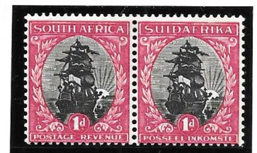
Complete trial Gummed paper Springbok head watermark