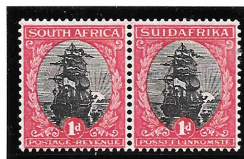
Complete trial Gummed paper Trefoil watermark