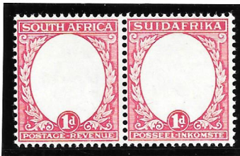
Exterior Cylinder Perforate Un-gummed paper No watermark