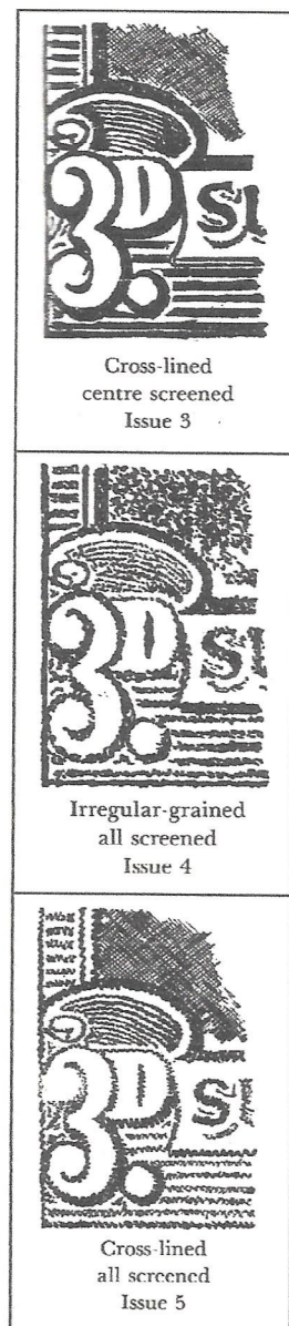
Cross-lined centre screened Issue 3

Cylinder was screened with a cross-lined screen. This show on the stamps in serrated edges of the frame lines and a mesh background of the darker parts of the sky